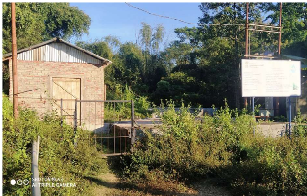
of tap water yet remains a dream for the people of the area.

But the irony was that the construction work for the water supply scheme at the various locations of Borobekra Sub-Division was started in the year 2020 but the supply